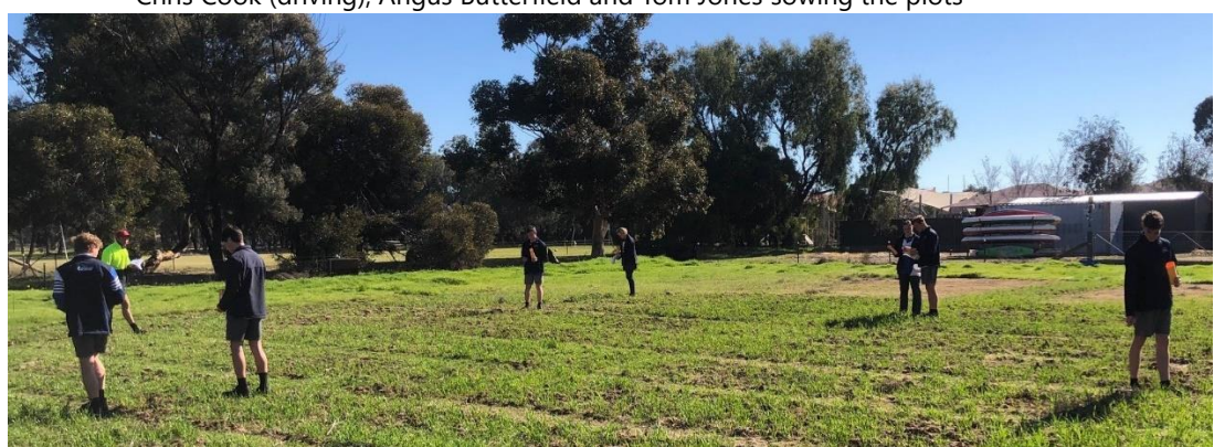
Students spreading urea on different plots