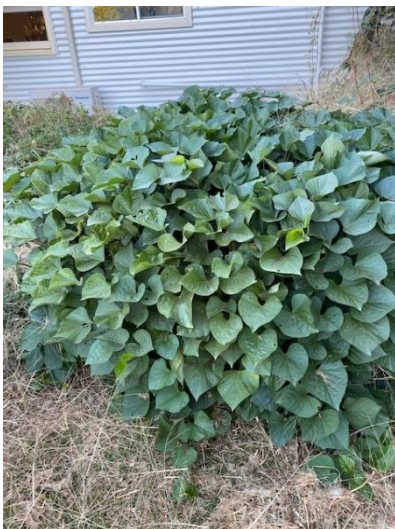
Sweet potato going berserk

This week I am planting some garlic, cauliflower, broccoli, coriander, beetroot and snow peas.