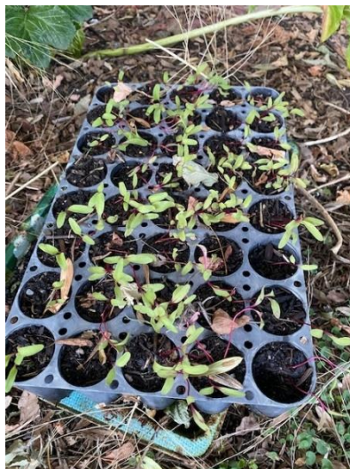
I soaked the beetroot seed in a Seasol mix overnight. I had a quick and robust response.